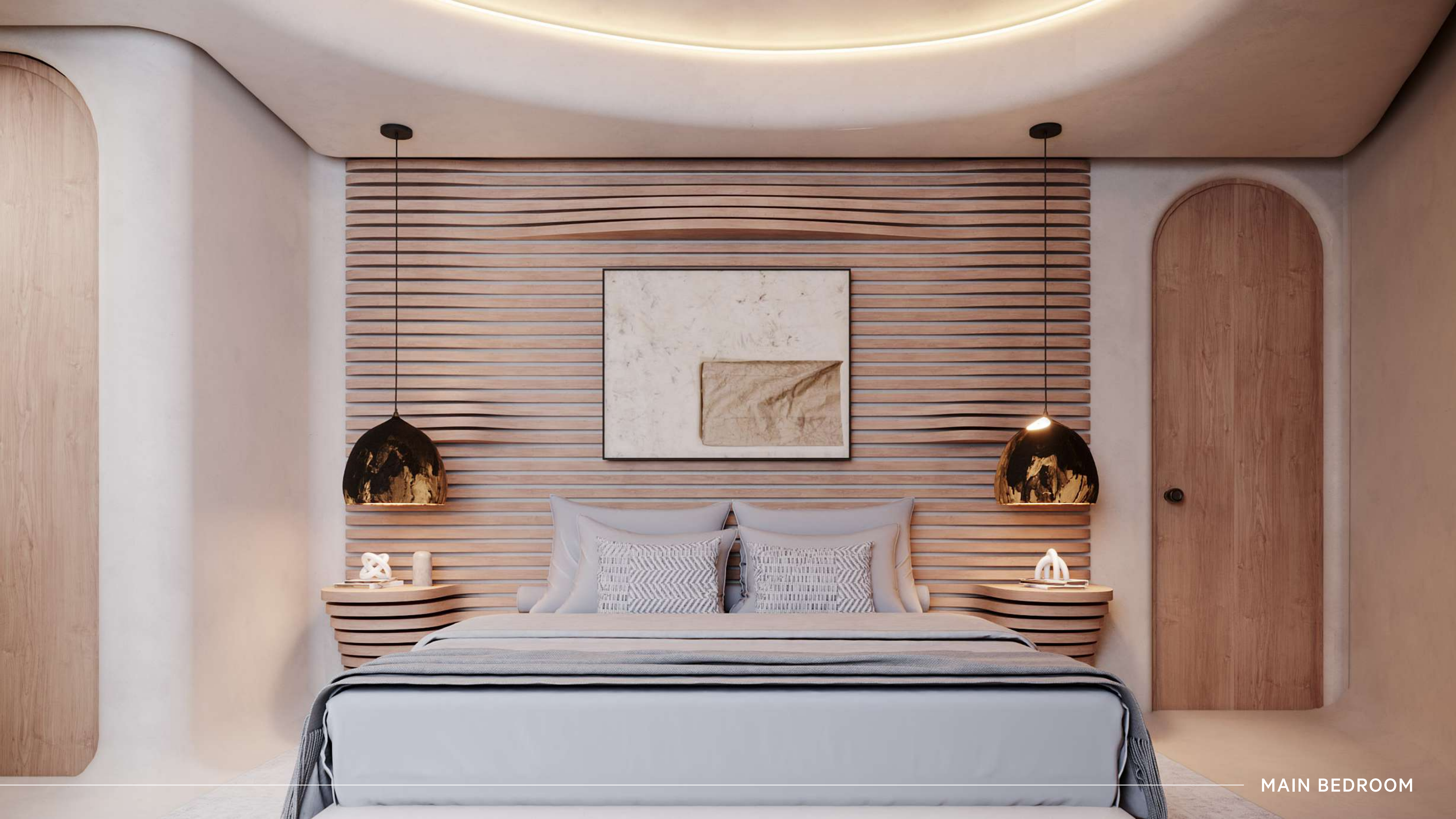
— MAIN BEDROOM