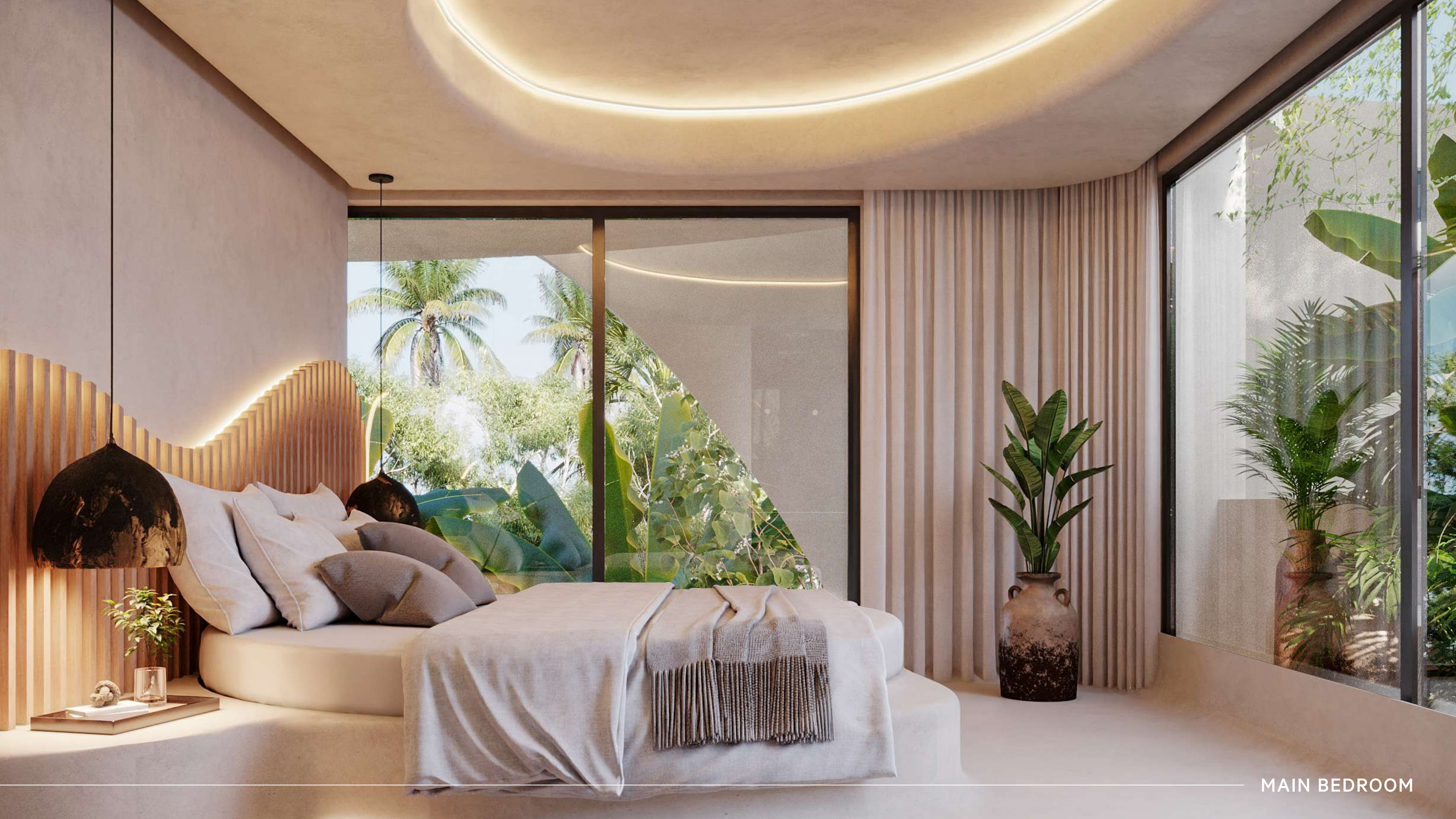
— MAIN BEDROOM