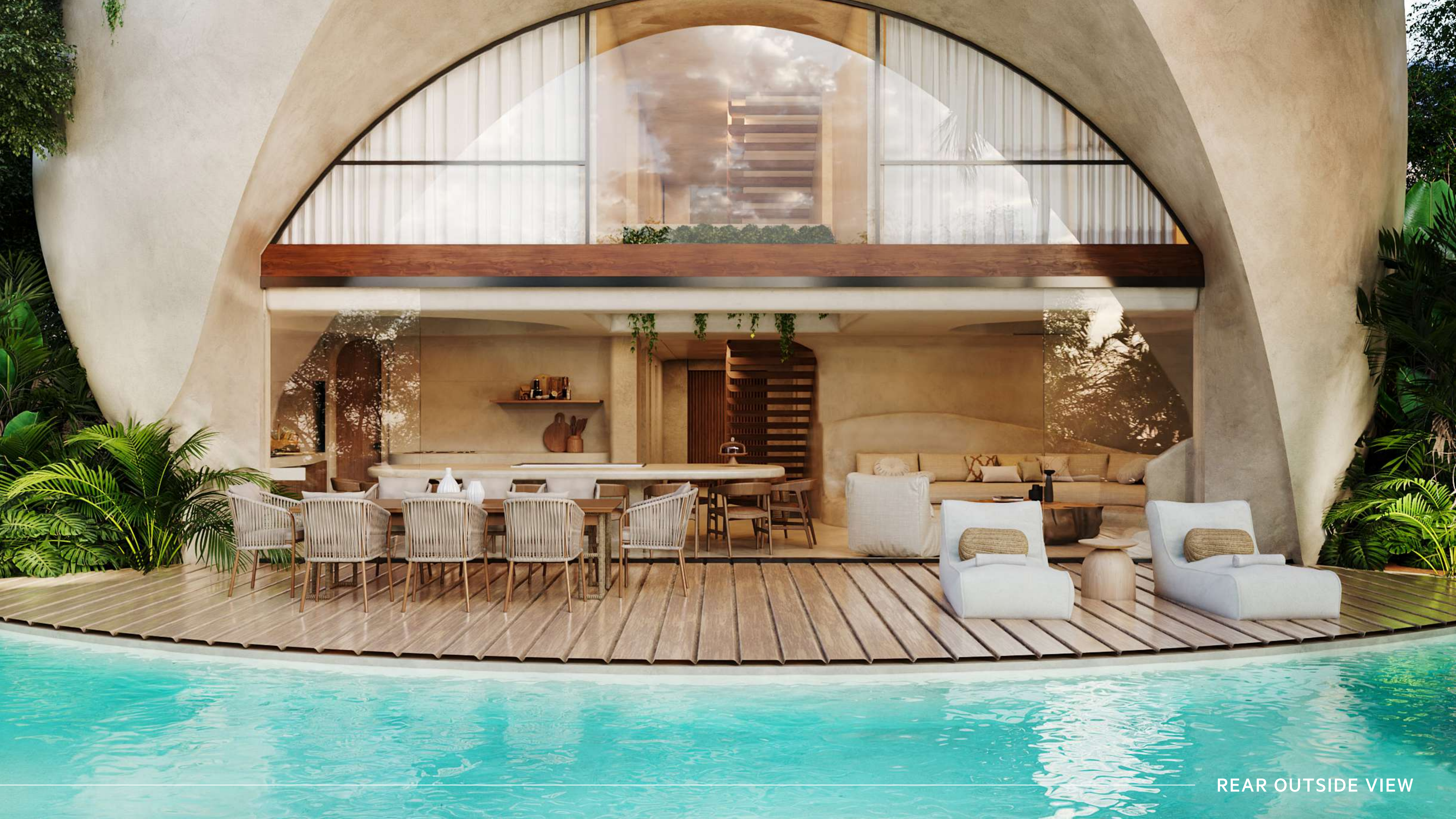
REAR OUTSIDE VIEW